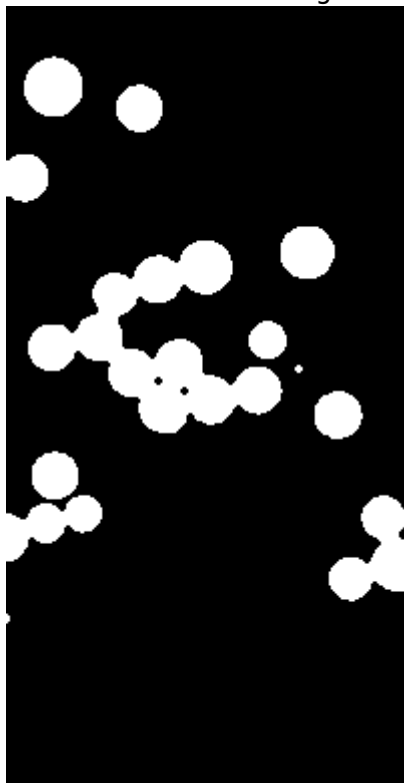
Multiclass CD map